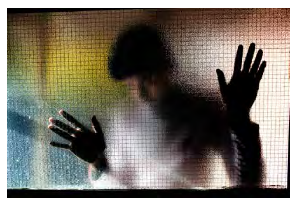
A Tamil who was tortured by Sri Lankan authorities

but three had claimed asylum and were forcibly removed after their asylum claims were rejected. All but seven of these people were detained within weeks of their arrival in Sri Lanka and the majority were specifically interrogated about their reasons for being in the UK, their activities and/or their contacts in the UK. Twenty-one people were accused of attending particular protests and demonstrations in the UK and eleven were shown photographs taken at these events.