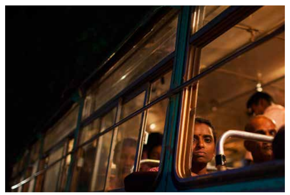
A Tamil woman sits on a bus in Kilinochchi, Sri Lanka