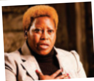
As part of their recovery, survivors can share and use their stories to fight for change.