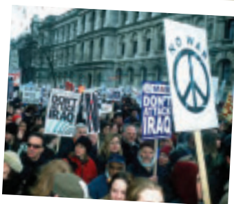
Freedom from Torture staff and supporters join the Stop the War in Iraq demo, London, 15 Feb 2003.