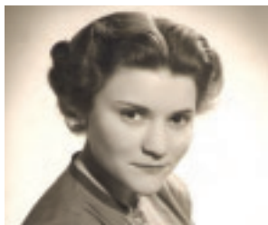
Helen Bamber led us in our early years.