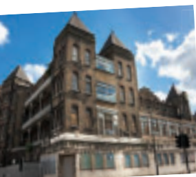
This is our first premises at the National Temperance Hospital, London.

We move into our purpose-built headquarters in Finsbury Park.