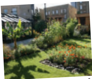
Our headquarters is a place of tranquillity and the perfect setting for individual and group therapy.